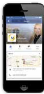
Social Media Banners