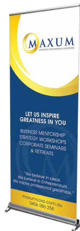
Pull Up Banner